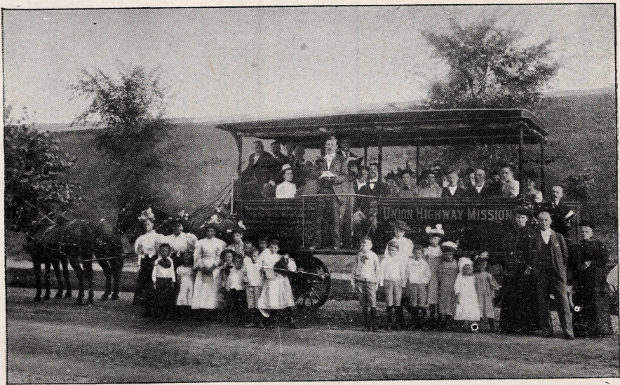
GOSPEL WAGON OF THE HIGHWAY MISSION TABERNACLE.