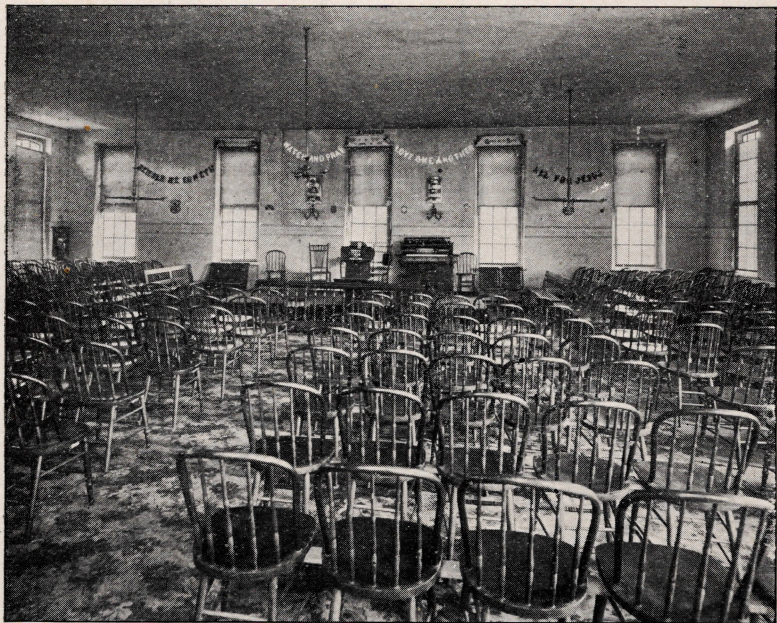
MAIN AUDIENCE ROOM.