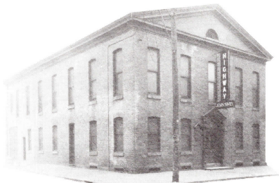
1897 — Progressing rapidly Highway acquired an eight-room schoolhouse at 22nd and Oxford Streets, to accommodate the hundreds of persons being converted.