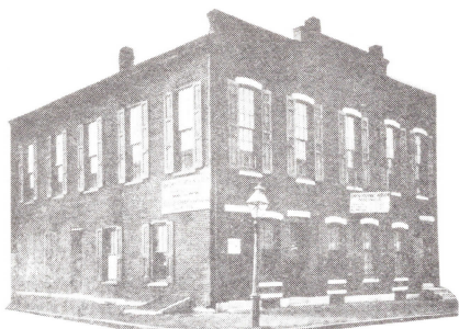
Highway Mission Tabernacle — 1895. A permanent meeting place was established in an upper room of this building at 23rd and Jefferson Streets.