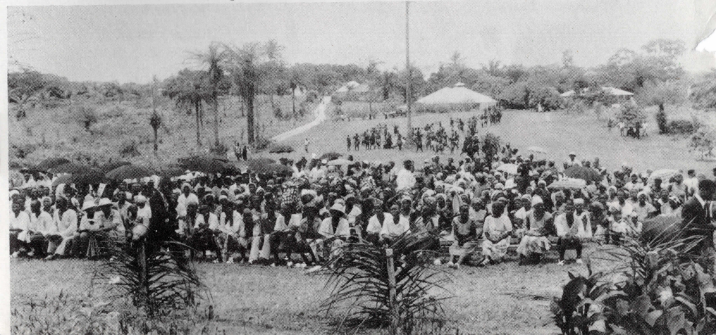
Lepers listening to the President's address