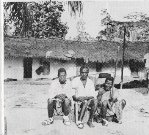
Mud, thatch-roofed structures are being replaced by brick, aluminum-roofed houses