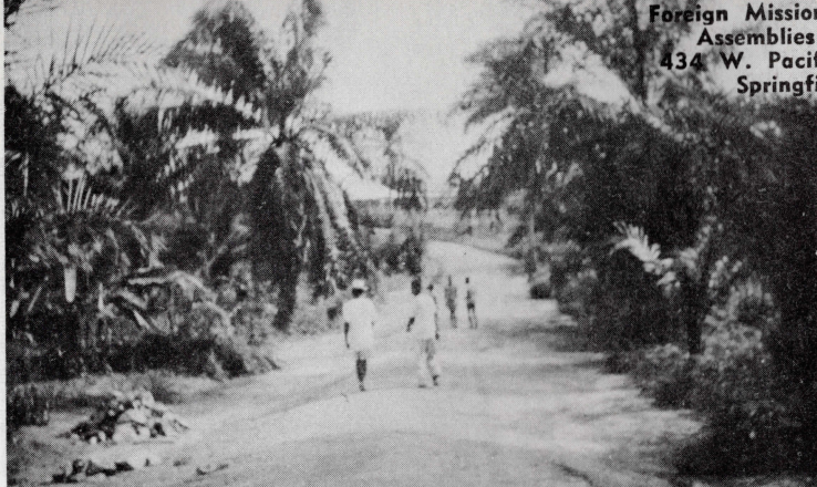
Entering New Hope Town