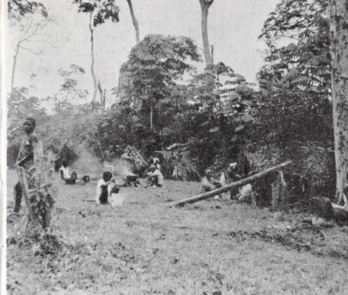
Brush House Town—the beginning of New Hope

She knew that if she were to go to the foreign field she would need training, so she enrolled at the Missouri Baptist Hospital in