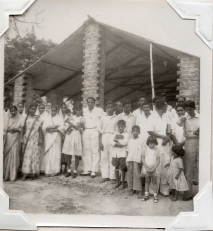
The Modder's Church