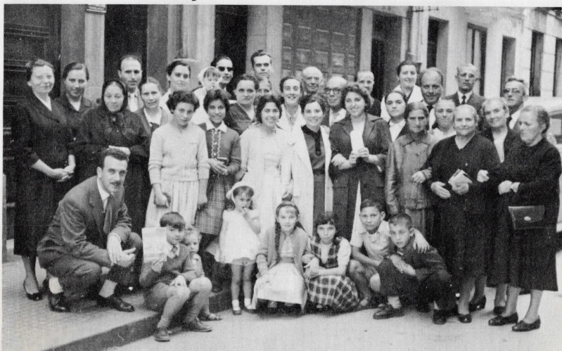
Group of believers in La Coruña

Protestant gatherings are confined to buildings that have been granted government permits. In all of Spain, it is reported that there are less than 200 such permits and a new one is rarely granted. An evangelical place of worship may not be built to resemble a church; no cross may be used outside; nor may any sign be placed where it will be visible from the street. Only through personal witnessing may a congregation announce its services. Even this may be termed "propaganda" and the offender is liable to arrest. However, in spite of these restrictions, there is still a Protestant community in Spain.