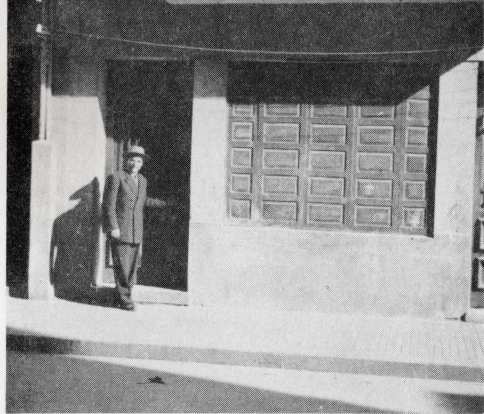
Assembly of God church in La Coruña