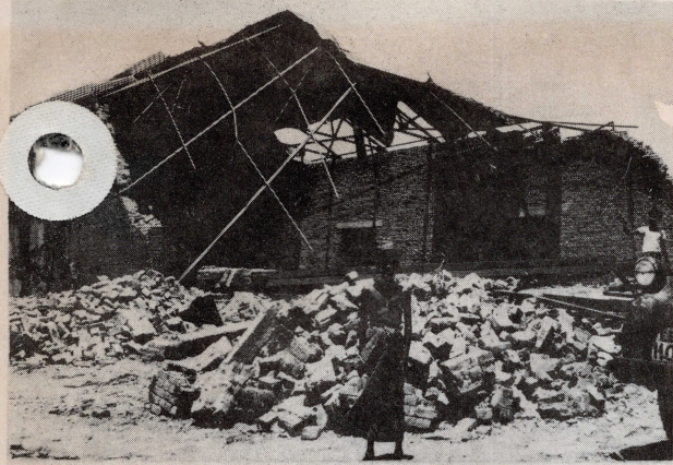
Warehouse destroyed in cyclone.