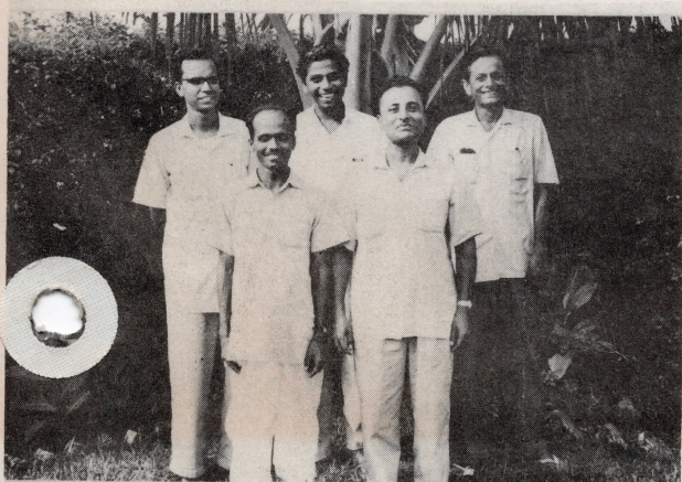
Newly elected Executive Committee members.

Assemblies of God Mission P.O. Gopalganj, Faridpur East Pakistan July 20, 1963